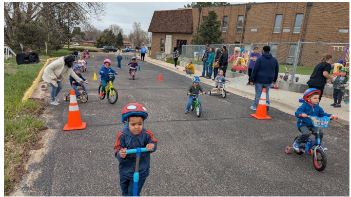
The preschool held a fun trike-a-thon to raise money for St. Jude's Children's Hospital. They not only helped other children with life threatening illnesses but also learned some bike/trike safety in the process.

Holy Cross, a community that's transformed through genuine SERVICE so all may follow him.